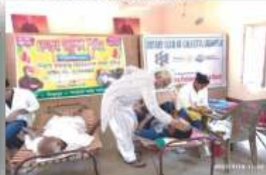
Blood donation camp