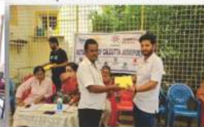
Mosquito net distribution