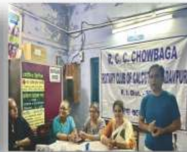
Workshop on composting at RCC Chowbaga