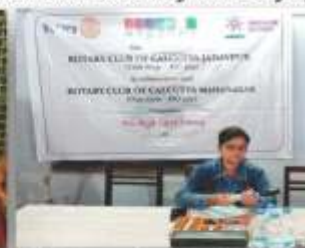
Cataract screening and surgery