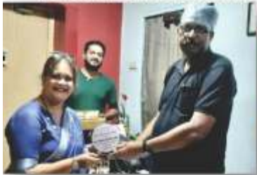
Felicitating general physicians