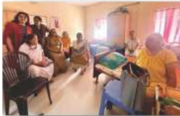
Donating a refrigerator to an old age home