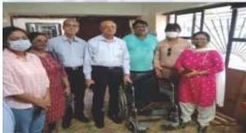
Continuous Financial support to survivors for rehabilitation