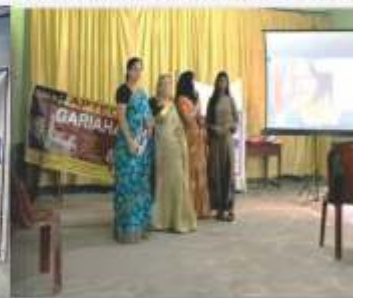
Training seminar on career in computers at St. Ninian's Sch