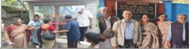
Toilet inauguration at Sondhi School, RCC-Canning, Mid-day meal shed at AHV School