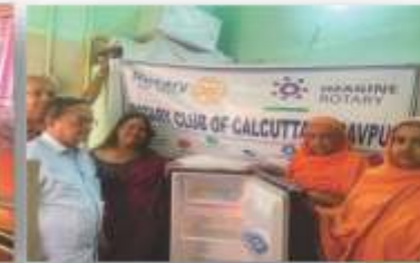
Donating a refrigerator To Matribhevan, Kolkata