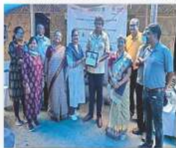
Workshop on mushroom cultivation and apiculture at RCC Canning