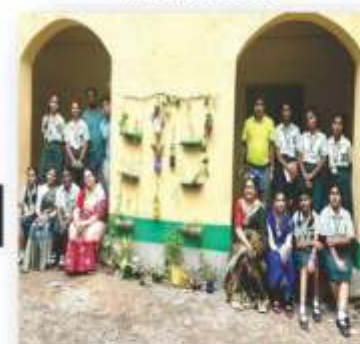
Putting up a Vertical Garden at St. Ninian's School with Rotaractors and Interactors