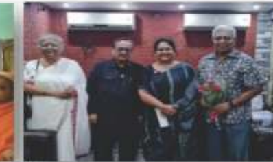
Financial support to RCFC for orthopaedic surgeries of the needy