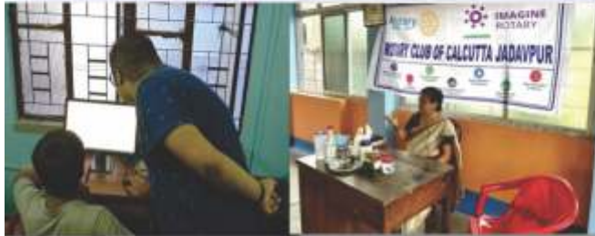
Monthly Tuition Classes